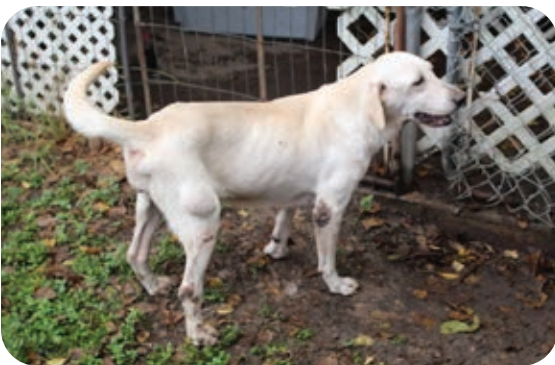
Our Animal Cruelty Investigators discovered animals in urgent need, including this dog with a tumor. Thank you for coming to the rescue!

You came to the rescue again when our Animal Cruelty Investigators partnered with Harris County Precinct 1 to rescue nearly 50 animals from neglect.