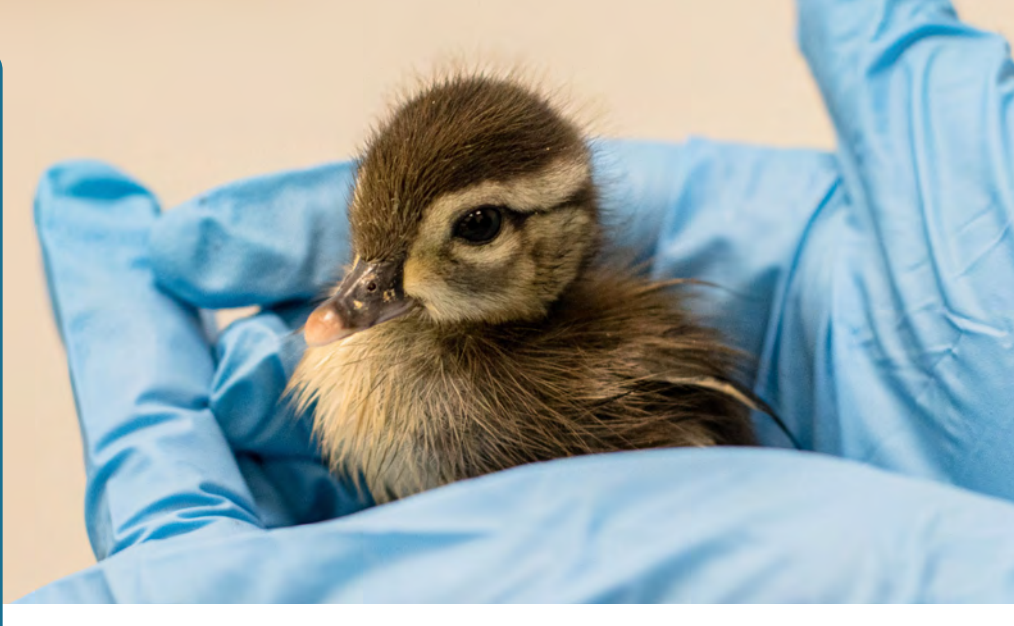
Your donations help power one of the largest wildlife rehabilitation centers in the nation!

n the past year, the Houston SPCA's Wildlife Center of Texas recorded a record-breaking intake of 14,287 injured, ill, and orphaned wild animals, ranging from baby squirrels to majestic great horned owls. Your generous support has been instrumental in enabling us to meet the escalating demand for our services.