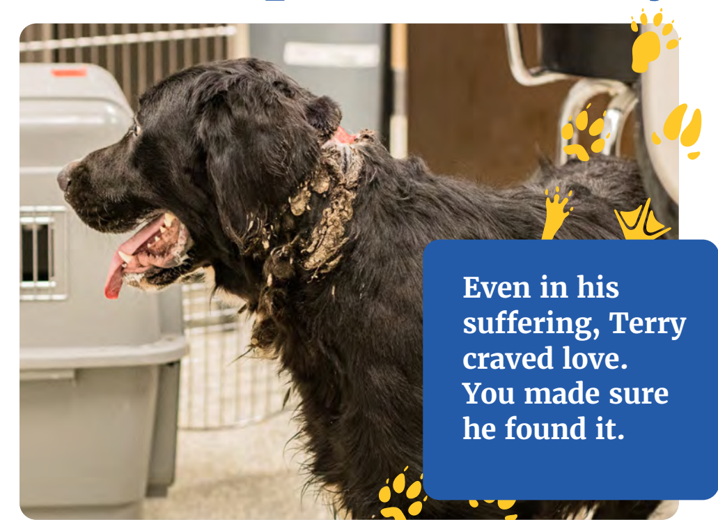
Terry was suffering from neglect, a deep wound, and infection. You helped us rescue him.

But Terry basked in our care, sweetly wagging his tail through it all. Our team changed his bandages to keep his wound clean and, week by week, Terry healed both